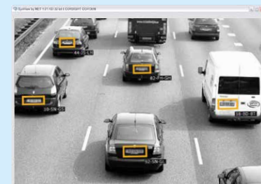
WLAN / BLUETOOTH / GSM GIGABIT ETHERNET (POE+)