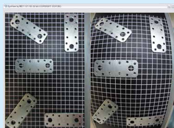
WINDOWS EMBEDDED STANDARD 7, LINUX / STANDARD IMAGE PROCESSING SOFTWARE PACKAGES